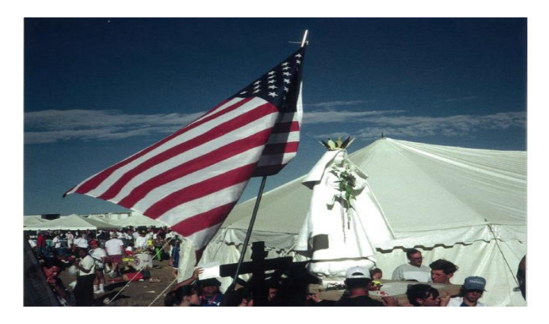
Papal Mass - World Youth Day - Denver 1993- First in America