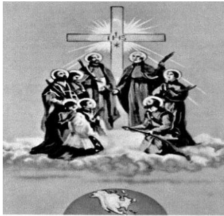
JESUIT MARTYRS OF NORTH AMERICA 1642 - 1649