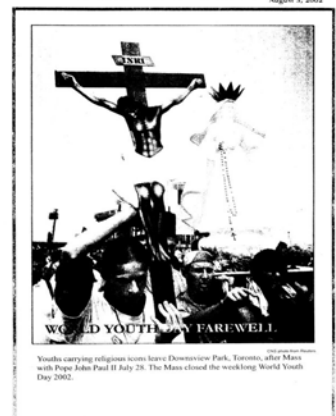
Statue carried in WYD in Canada

The Catholic Virginian Serving the People of the Diocese of Richmond August 5, 2002