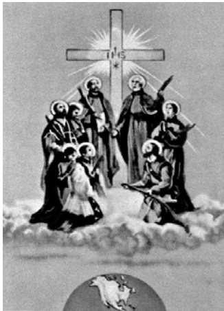
JESUIT MARTYRS OF NORTH AMERICA 1642 - 1649

September 26, 1956: Our Lady appears twice under the new image of Our Lady of America (A)